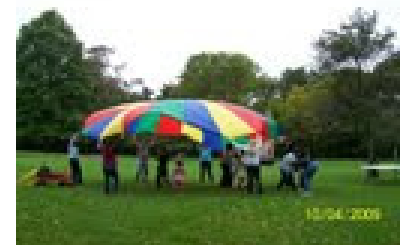
Picnic at Endicott Park

Save the date! 8th Annual PICNIC October 3rd 12 noon to 2 pm Endicott Park, Danvers