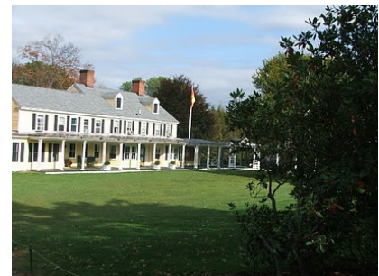
Clubhouse at Myopia

Northeast Arc Development Officer, at 978-762-4878 or blandry@ne-arc.org